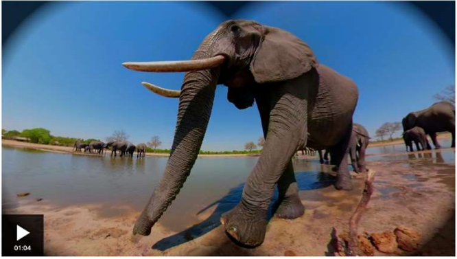
VR headsets help stressed NHS staff escape reality